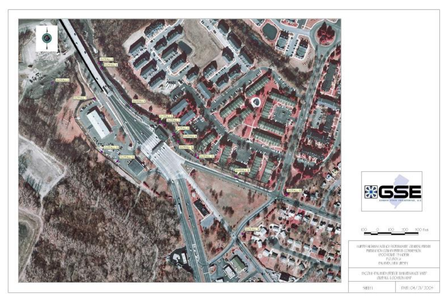
Receiving Waterbody: Stream leading to Delaware River