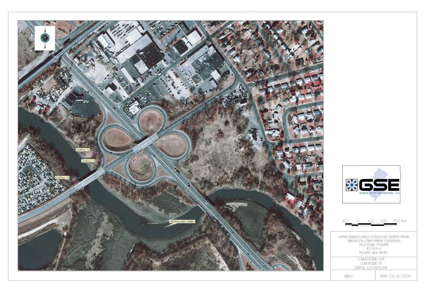
Receiving Waterbody: Pennsauken Creek