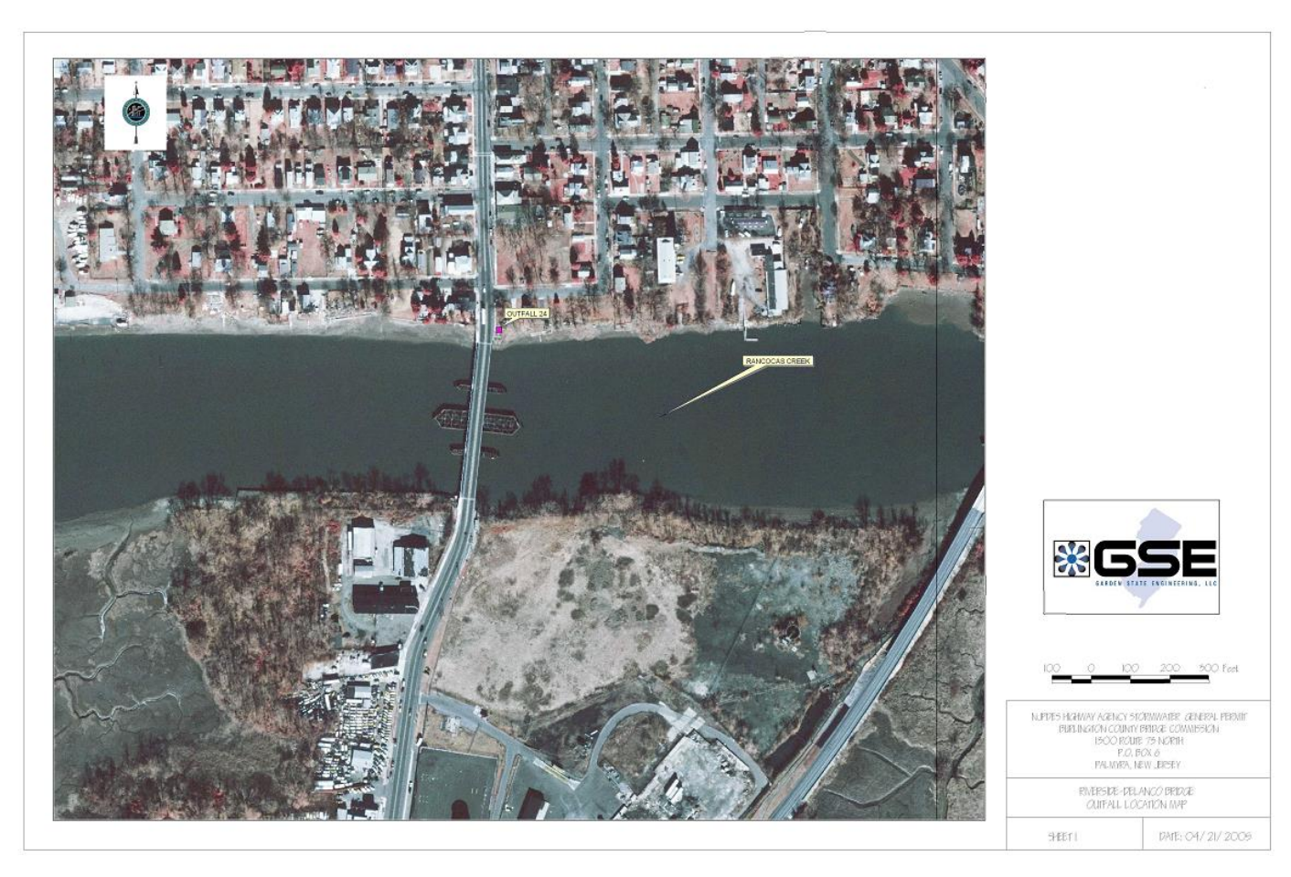
Receiving Waterbody: Rancocas Creek