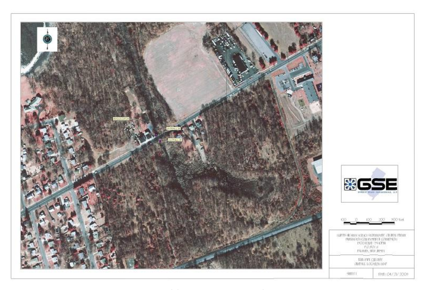
Receiving Waterbody: Boggs Ditch