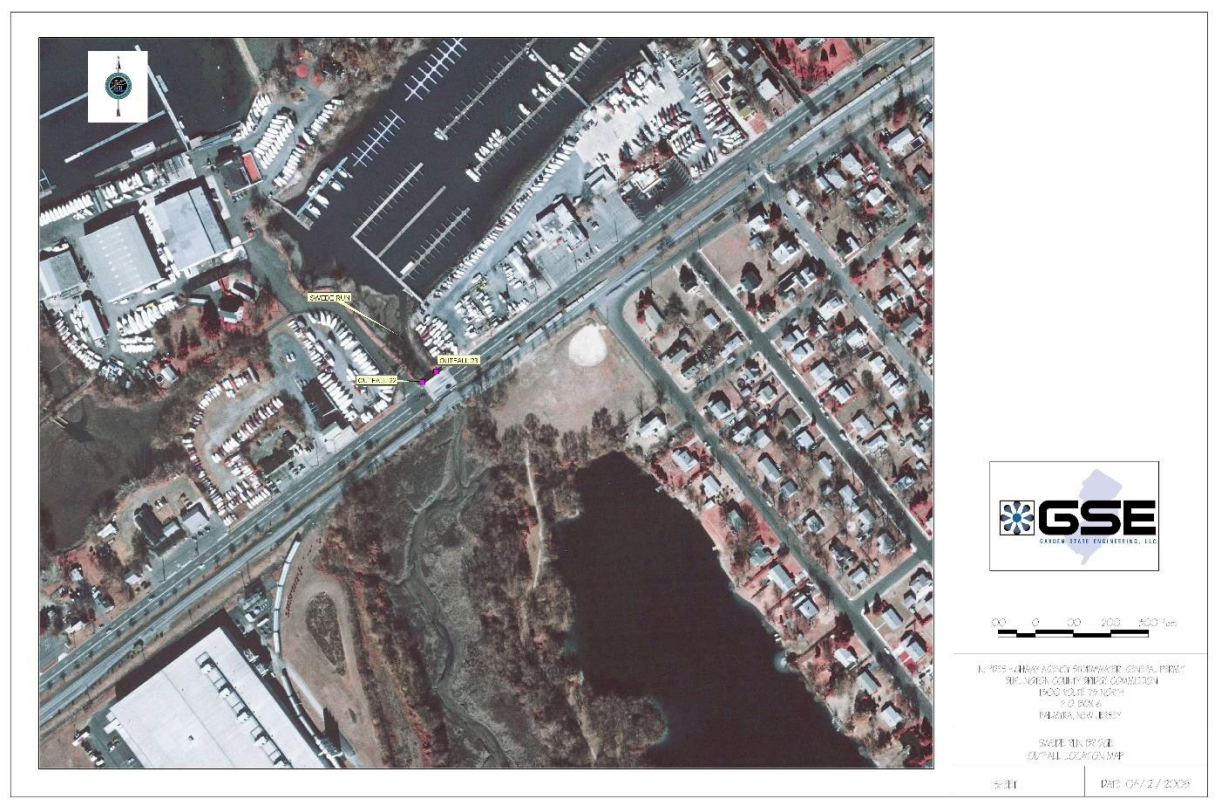
BCBC/ NJPDES # NJG0148547 / April 1, 2022