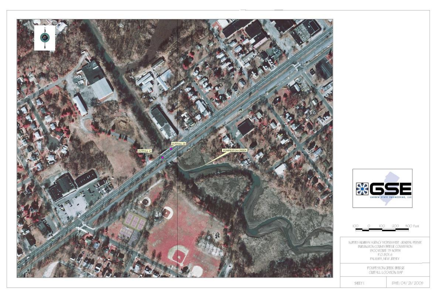
Receiving Waterbody: Pompeston Creek