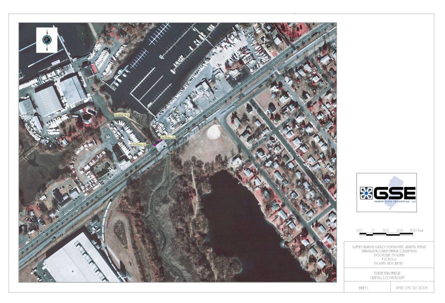
Receiving Waterbody: Swedes Run Creek